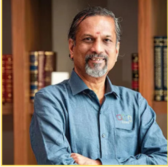
Padma Shri Sridhar Vembu CEO, Zoho Corporation. Chairman, Swadeshi Shodh Sansthan, New Delhi