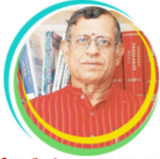
Chief Advisor & Patron Shri Swaminathan Gurumurthy Ji Director (Part time), Central Board, Reserve Bank of India