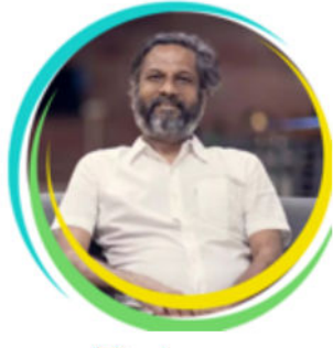
Patron Padma Shri Sridhar Vembu CEO, Zoho Corporation