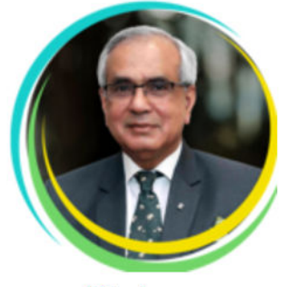
Patron Dr. Rajiv Kumar, Former Vice-Chairman, NITI Aayog