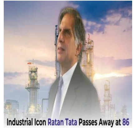
Industrial Icon Ratan Tata Passes Away at 86

Padma Vibhushan Ratan Tata has championed the cause of swadeshi industry so gloriously that today Bharat has remarkable global presence in several sectors. The baton of swadeshi was passed over to him by Jamsetji Tata. He then, crossed several milestones in his race to place Bharat among one of the industrially most advanced nations. From steel to defence production and from IT to Airlines the Tata Group has contributed enormously for the nation.